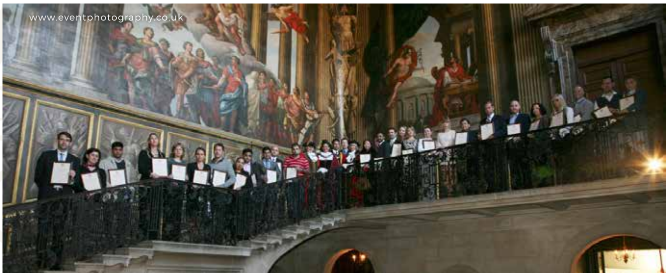
Citizenship Ceremony at Hampton Court Palace